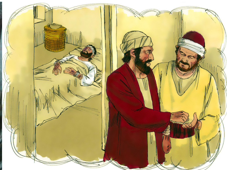
Good Samaritan Gives Without Recognition, Luke 10:25-37

Take heed that ye do not your alms before men, to be seen of them: otherwise ye have no reward of your Father which is in heaven.