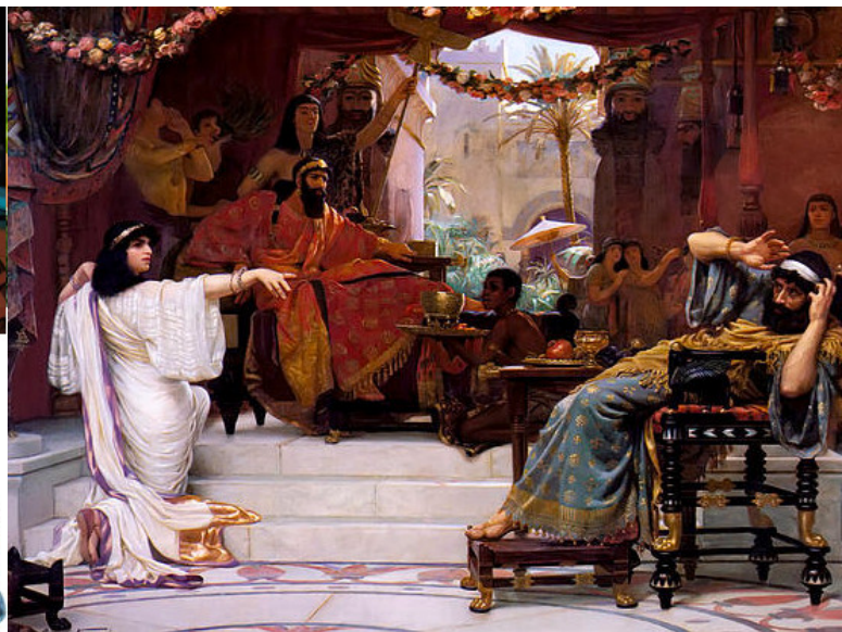
Haman is Judged How He Wanted Mordecai Judged, Esther 7:9–10

But seek ye first the kingdom of God, and his righteousness; and all these things shall be added unto you. Matthew 6:33