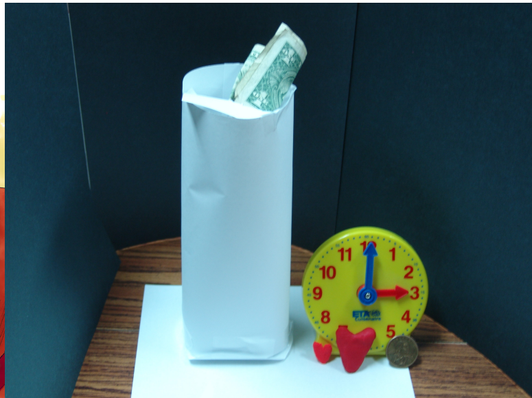
Putting Treasures in Heaven

For if ye forgive men their trespasses, your heavenly Father will also forgive you: But if ye forgive not men their trespasses, neither will your Father forgive your trespasses. Matthew 6:14–15