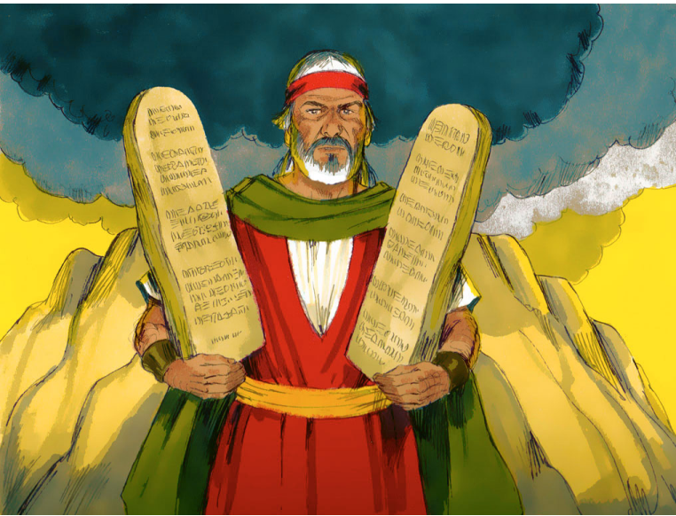
The Law Remains

Think not that I am come to destroy the law, or the prophets: I am not come to destroy, but to fulfil. For verily I say unto you, Till heaven and earth pass, one jot or one tittle shall in no wise pass from the law, till all be fulfilled.