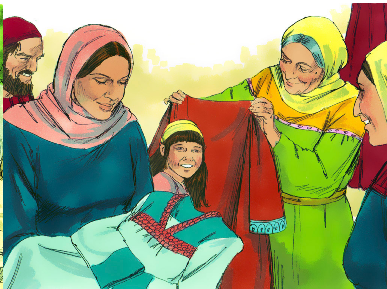
Dorcus Lets Her Light Shine, Acts 9 : 36–41

Let your light so shine before men, that they may see your good works, and glorify your Father which is in heaven.