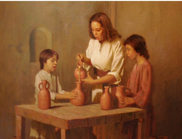
God Supplies Widow's request, 2 Kings 4 : 1-7

Ask, and it shall be given you; seek, and ye shall find; knock, and it shall be opened unto you: Matthew 7 : 7