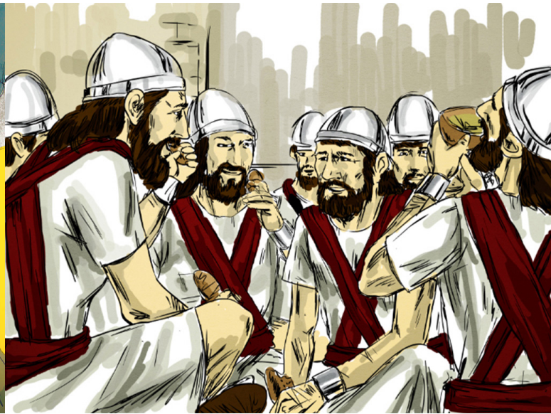
Israel's King Loves His Enemies, 2 Kings 6:22-23

But I say unto you, Love your enemies, bless them that curse you, do good to them that hate you, and pray for them which despitefully use you, and persecute you;