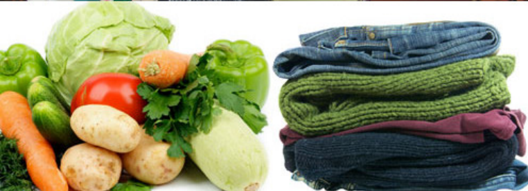
God Provides Food and Clothing

But seek ye first the kingdom of God, and his righteousness; and all these things shall be added unto you. Matthew 6:33