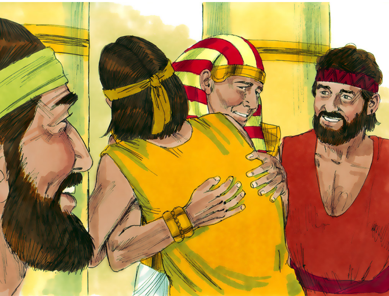
Isaac forgives the herdsmen of Gerar. Genesis 26:19–25

For if ye forgive men their trespasses, your heavenly Father will also forgive you: But if ye forgive not men their trespasses, neither will your Father forgive your trespasses. Matthew 6:14–15