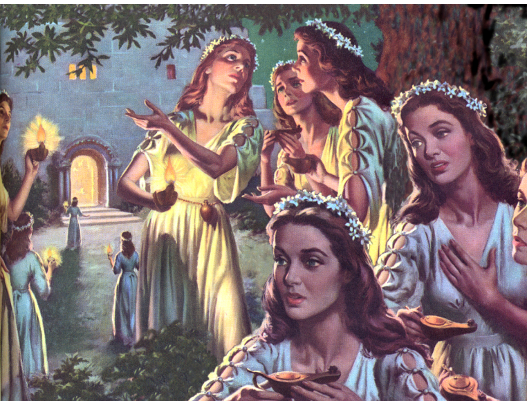
Five Wise Virgins Enter God's Kingdom, Matt. 25 : 1-13

Therefore all things whatsoever ye would that men should do to you, do ye even so to them: for this is the law and the prophets. Matthew 7 : 12