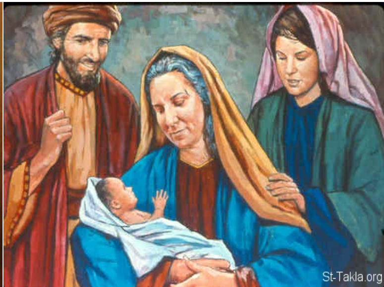
Ruth Cares for Naomi, Boaz Cares for Ruth, Ruth 1-4

Ask, and it shall be given you; seek, and ye shall find; knock, and it shall be opened unto you: Matthew 7 : 7