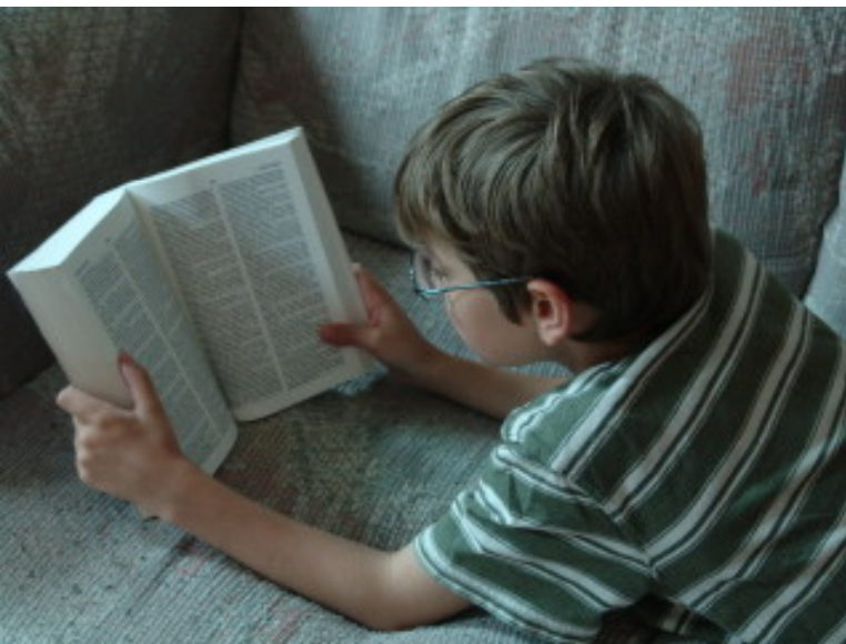
Learning to Be Perfect

Be ye therefore perfect, even as your Father which is in heaven is perfect.